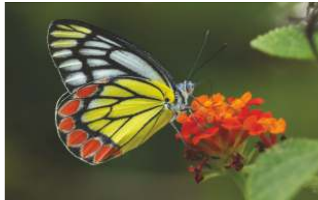
Common Jezebel Delias eucharis