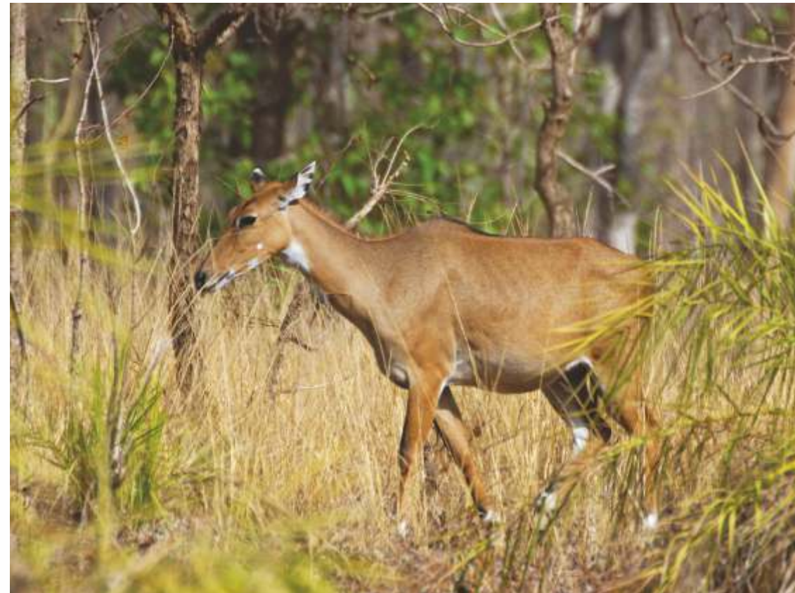
Nilgai Boselaphus tragocamelus

The protected area is rich in faunal life such as Leopards, Sloth Bear, Barking Deer, Sambar, Blue Bull, Spotted Deer, Hyena, Jungle Cat and Jackal. The Tigers are also sighted in the sanctuary.