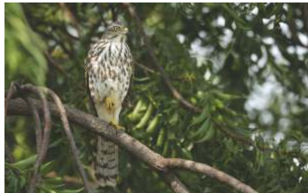
Shikra Accipiter badius