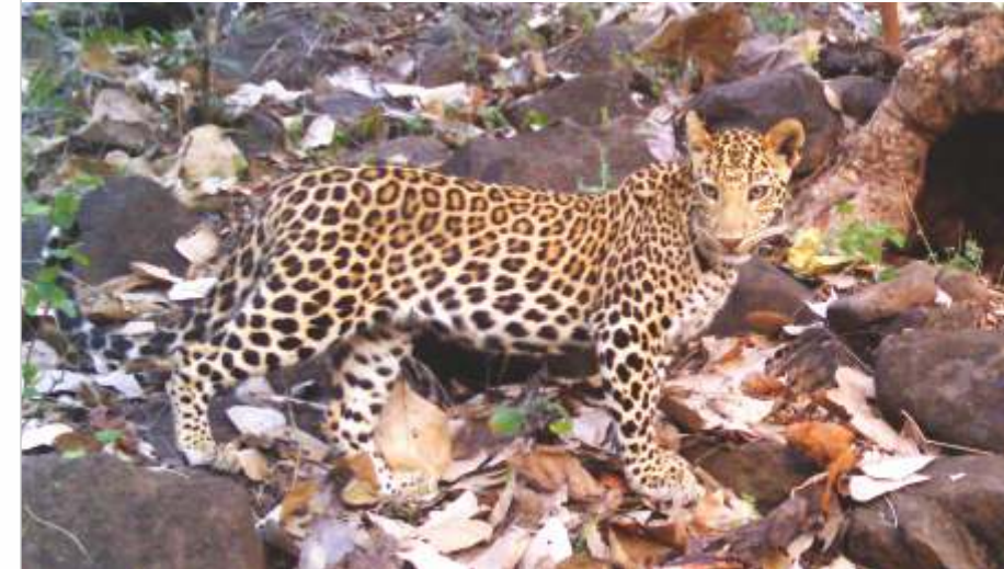
Common Leopard Panthera pardus