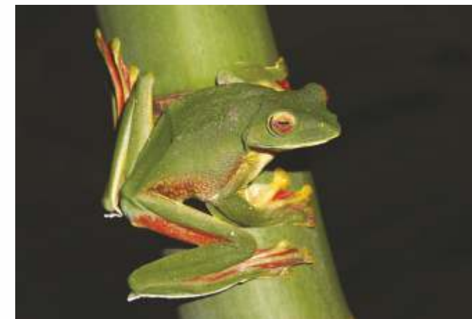
Malabar Gliding Frog Rhacophorus malabaricus

The NW Ghats in Maharashtra end just south of Amboli area, in the Tillari region. The entire region has well preserved wilderness. Dense semi-evergreen forests can still be seen. Recent surveys reveal high biodiversity of plants, insects, herpetofauna, birds and good densities of carnivores.