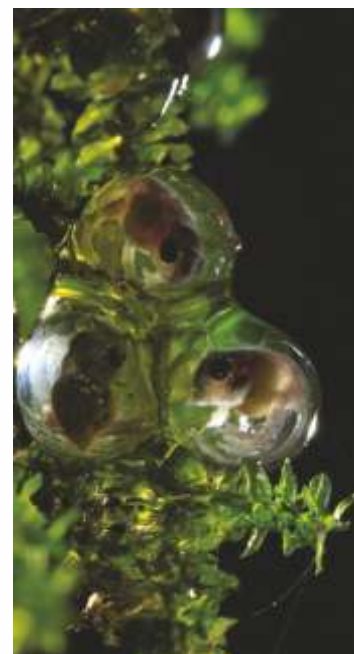
Eggs of Rincal Frog