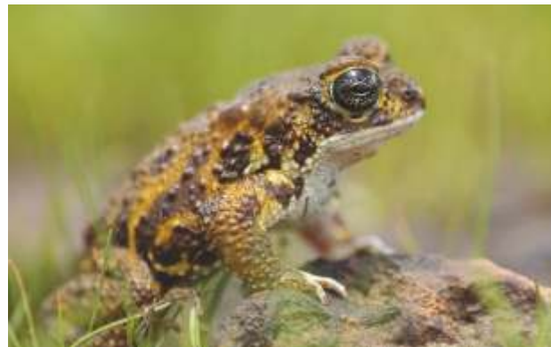
Amboli Toad Beduka amboli