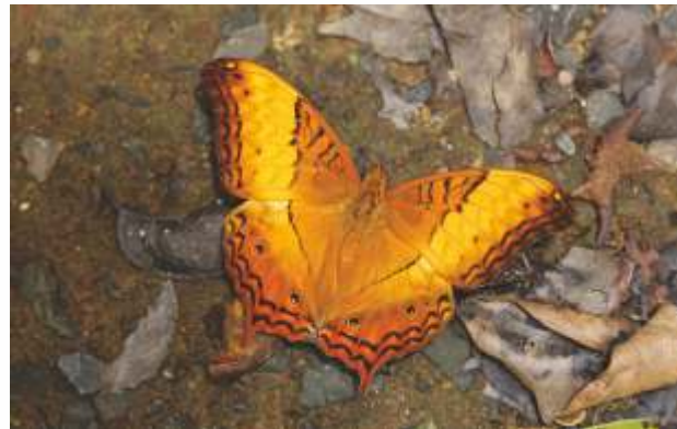
Cruiser Vindula erota