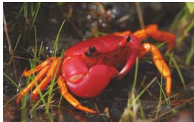
Pink Forest Crab Ghatiana Splendida

Moose plateau of Amboli is the type locality of Ceropegia jainii , a lateritic plateau specialist. It is one of the smallest Ceropegia and grows exclusively in lateritic rocky areas. Merremia rhynchorhiza is another typical plant of Amboli plateaus. It is also the type locality of Xanthophryne tigrinus , the Amboli toad and Gegeniophis danieli , an endemic caecilian. A diversity of other rare and endemic amphibians have been reported from Amboli plateaus and streams. In June 2013, a tigress with two cubs was spotted on Malai plateau by the tourists.