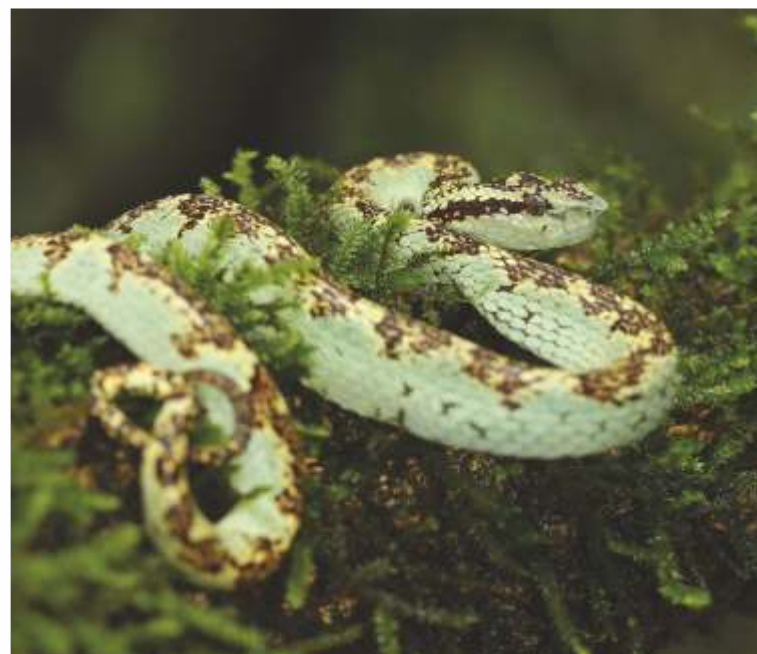
Malabar Pit Viper Trimeresurus malabaricus